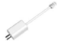
ePoE Over Coax Converter